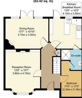
Ground Floor Approximate Floor Area 723 sq. ft (67.18 sq. m)

The Close, RH6 Approx. Gross Internal Floor Area 1,395 sq. ft / 129.60 sq. m